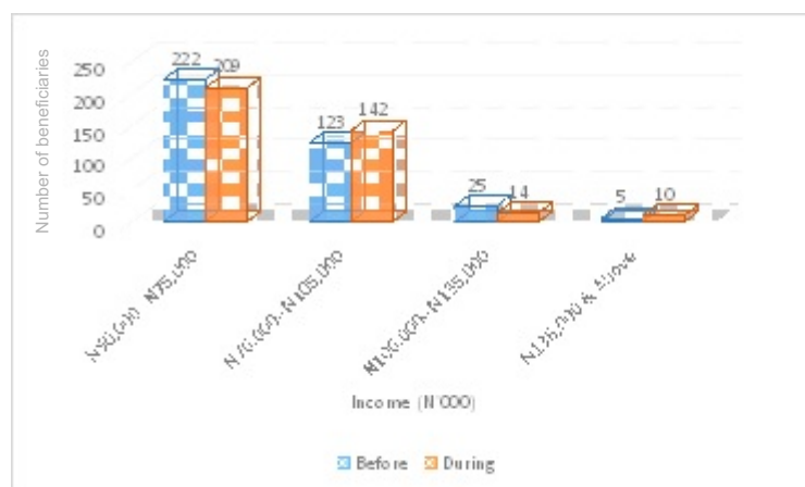
Figure 4. Income of the Beneficiaries Before and During the ABP.

The figure shows that before benefiting from the ABP, the 222 beneficiaries were earning between ₦50,000 and ₦75,000 from farming activities annually, but this number dropped to 209 after benefiting from the ABP. Furthermore, the figure reveals that before benefiting from the ABP, 123 beneficiaries were earning between ₦76,000 and ₦105,000 from farming activities, but this increased to 142 after benefiting from the ABP. Also, 25 beneficiaries were earning between N106,000 and N135,000 from farming activities before benefiting from the ABP but after benefiting from the ABP, this dropped to 14 beneficiaries. Finally, 5 beneficiaries were earning ₦136,000 and above from farming activities, however, after the ABP, this increased to 10. These results suggest that, on the whole, benefiting from the ABP has not increased the income of the beneficiaries. This may be because there was no significant increase in their farm outputs. In order to find out if there was a significant difference in the income levels of the beneficiaries as a result of benefiting from the ABP, the t-test was employed.